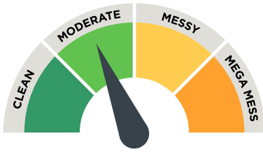
The Messy Meter